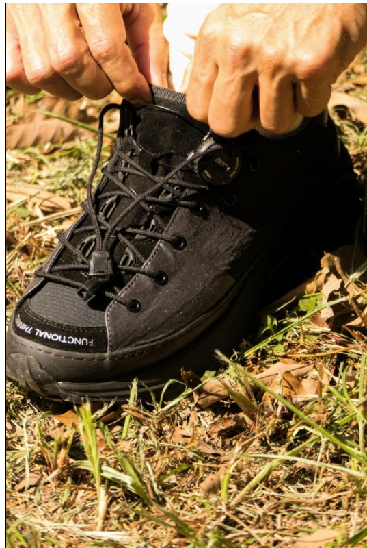
COMFY OUTDOOR GARMENT for 432Hz SPECIAL COLLABORATION 2021