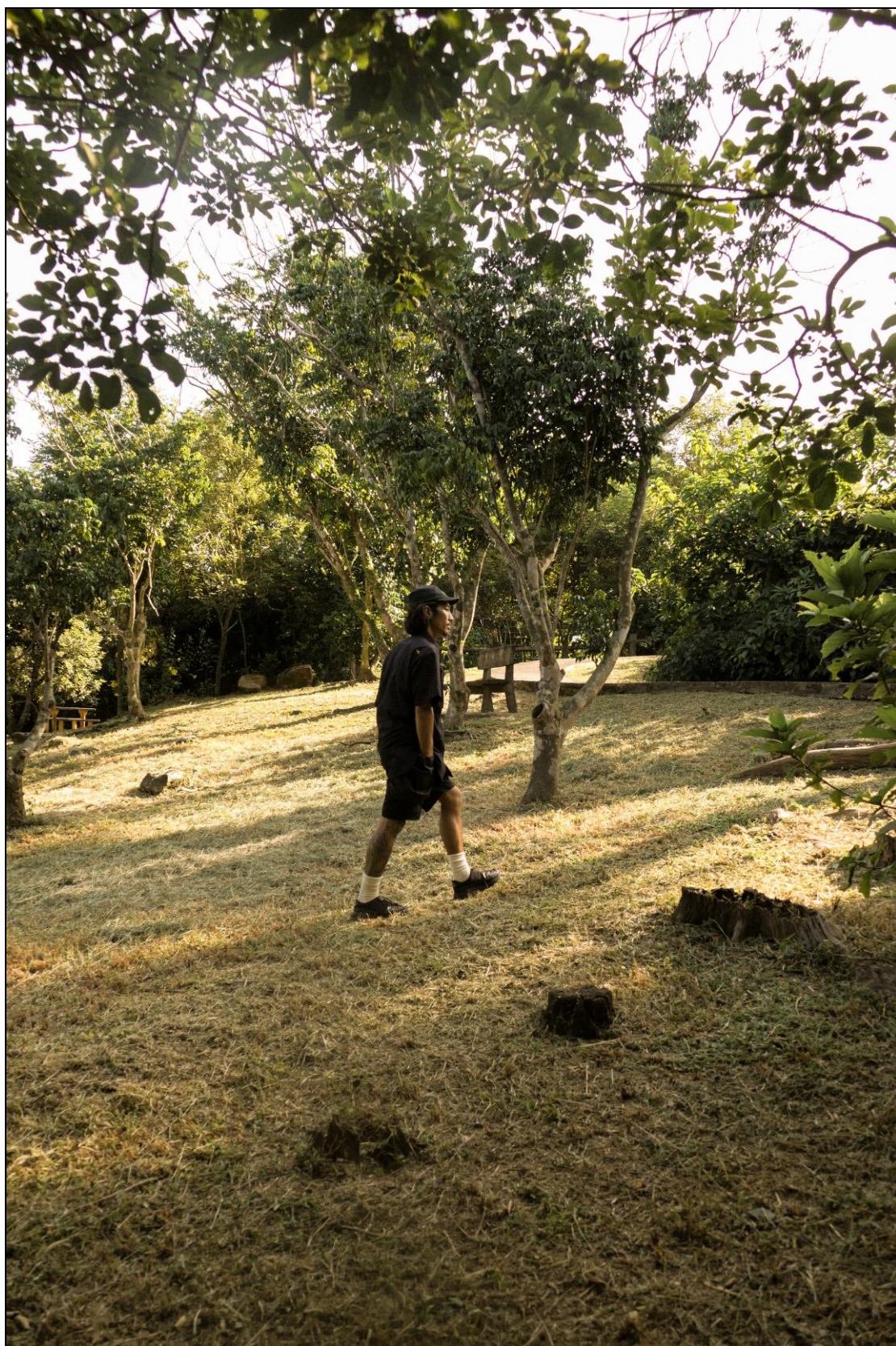
COMFY OUTDOOR GARMENT for 432Hz SPECIAL COLLABORATION 2021