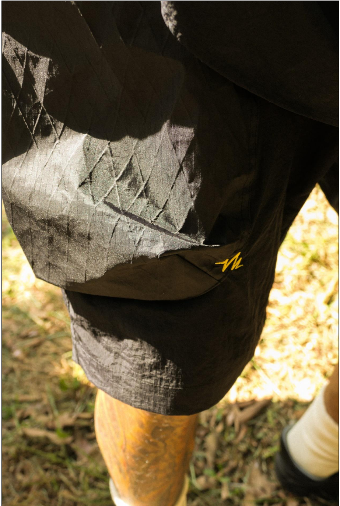
COMFY OUTDOOR GARMENT for 432Hz SPECIAL COLLABORATION 2021