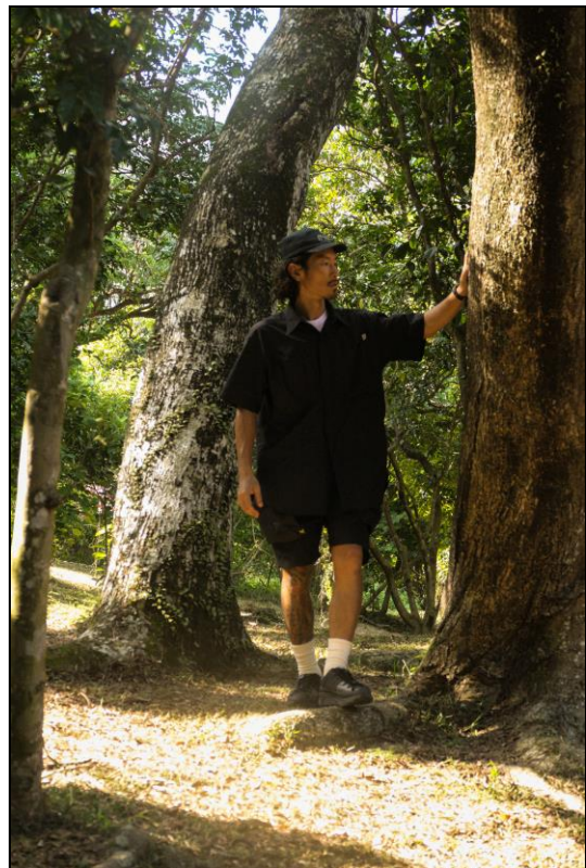
COMFY OUTDOOR GARMENT for 432Hz SPECIAL COLLABORATION 2021